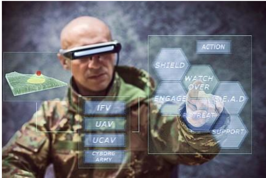
Figure 3: Mobility is one more layer of reality in terms of how the simulation system feels and acts for the trainee, more closely mirroring a real-life operational environment. Trainers benefit as well, gaining a greater level of global access to resources and users through a mobility infrastructure.

using system data from flight logs, checklists, or electronic flight bags. Coupled with a head-mounted display (HMD), the trainee executes the aircraft training protocol, and is supported by data such as the last time the aircraft was serviced, schematics, and step-by-step instructions on how to perform a specific service. Military programs can capitalize on the same distributed platform for soldiers training off-site, working in the field, engaged in battle, or handling routine maintenance of equipment and systems.